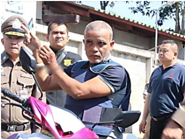
Thailand's 'Jack the Ripper' to hang | New Straits Times New Straits Times