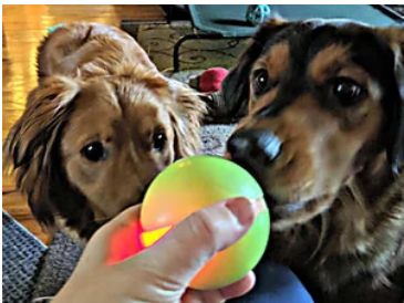
Insanely Cool Dog Toy That Keeps Your Pet Fit Sponsored | Dog Training Ball