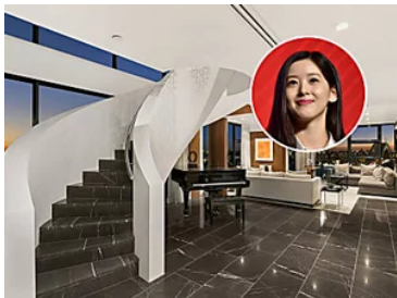
China's Youngest Female Billionaire Sells Sydney Penthouse at a Loss Sponsored | Mansion Global