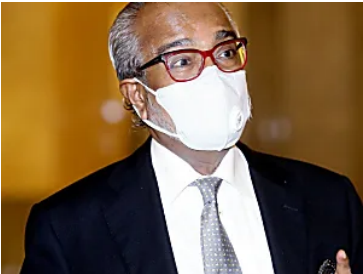
'RM4 billion taken out of country was an act of theft' | New Straits Times New Straits Times